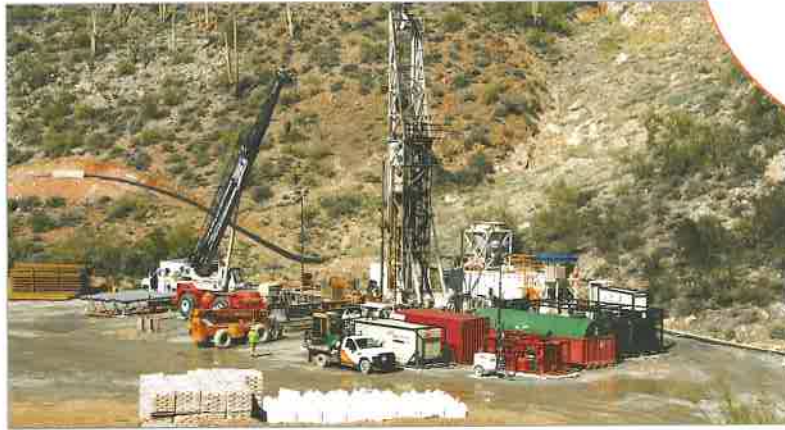
Dual-tube flooded reverse-circulation drilling in Arizona

"The dual-tube flooded reverse-circulation process can drill large-diameter holes in difficult ground conditions in a single pass"