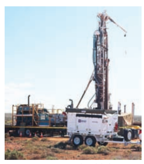
on site in South Australia